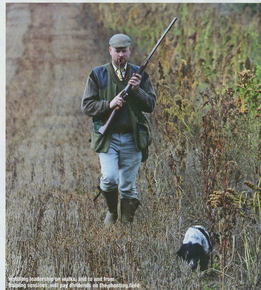
Instilling leadership on walks, and to and from training sessions, will pay dividends on the shooting field