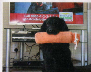
There are plenty of opportunities for training your gundog in the home

When you're watching TV, use the ad breaks to do a little retrieve. When he's a puppy just sit on the floor with him between your legs (facing away from you to protect his little joints) and toss the toy a couple of feet in front with a "get on". For the older dog you can work on steadiness by sitting him up and throwing his toys around the room and then making him retrieve them in the order that you want him to bring them back.