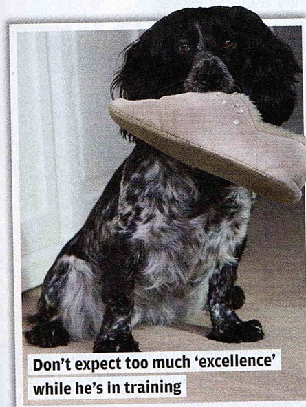
Don't expect too much 'excellence' while he's in training

"Most dogs like to bring something to you in the morning. Exploit it!"