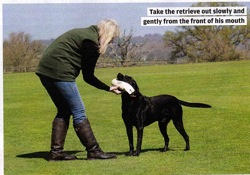
Take the retrieve out slowly and gently from the front of his mouth

Dogs not picking-up, losing interest or spitting out the dummy all stem from the same basic cause. A dog that is not motivated to retrieve is the typical "reluctant retriever", regardless of breed. None of these problems are insurmountable: time, patience, consistent handling and "getting inside of your dog's head" are what is needed.