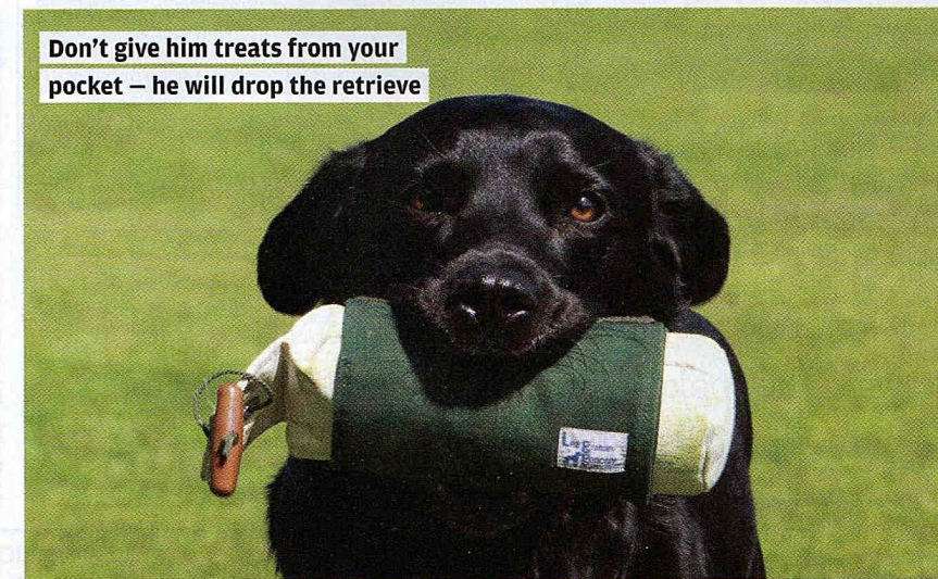
Don't give him treats from your pocket – he will drop the retrieve

is clever enough to realise that if you have a treat in your hand, they can't eat it when they have something in their mouth, so out comes the dummy.