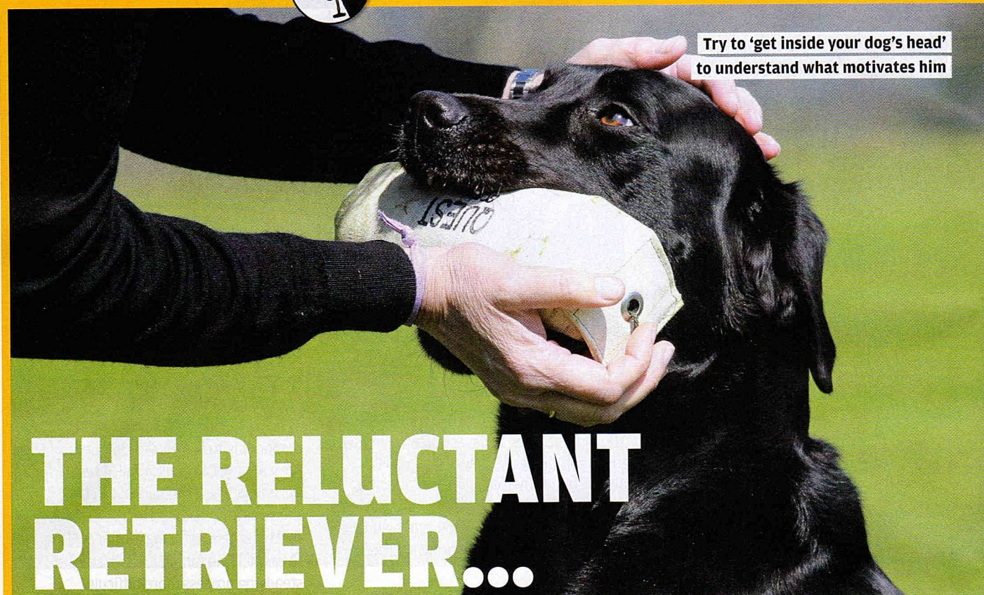
Try to 'get inside your dog's head' to understand what motivates him