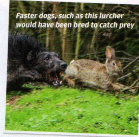
Faster dogs, such as this lurcher would have been bred to catch prey

Just as 'the pack' is central for the wolf, so too is it for the dog, more so for the early dog, which would have been 'tame' but not