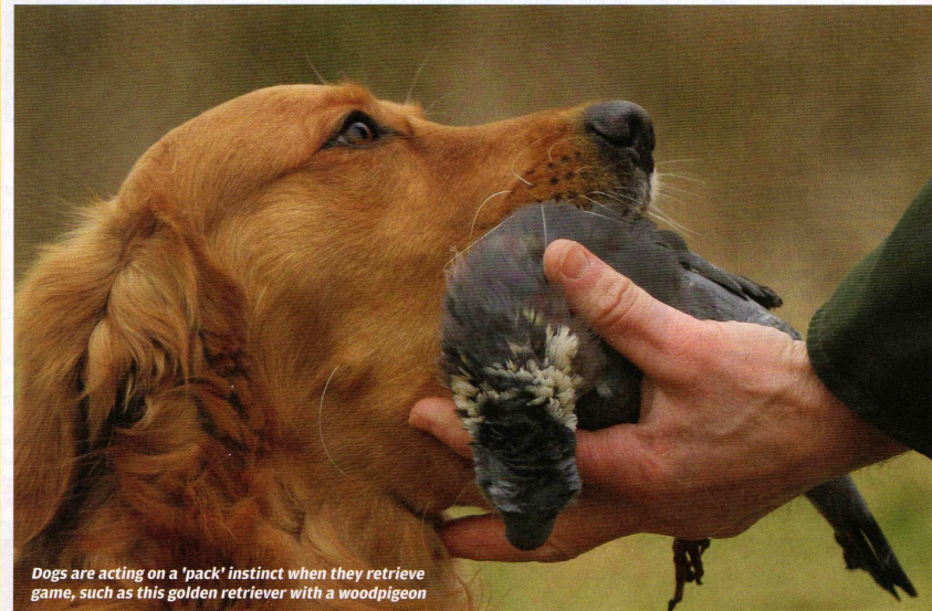
Dogs are acting on a 'pack' instinct when they retrieve game, such as this golden retriever with a woodpigeon

It is the inherent 'pack-centric' behaviour of bringing the spoils of the hunt back and deferring to the leader that makes dogs such good hunting companions