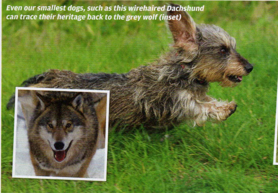
Even our smallest dogs, such as this wirehaired Dachshund can trace their heritage back to the grey wolf (inset)

When you see a gundog bury a retrieve, it's harking back to that instinctive behaviour of creating a food cache for later retrieval