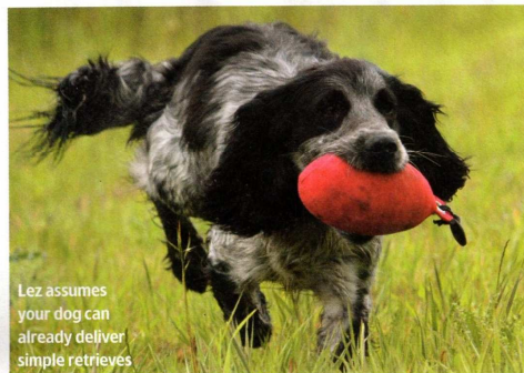
Lez assumes your dog can already deliver simple retrieves

Lez's approach is quite simple: it's to work with your dog sympathetically, but at the same time ensuring that you understand how it thinks, how it behaves, and how best to get it to work for you. You won't be surprised that she has no